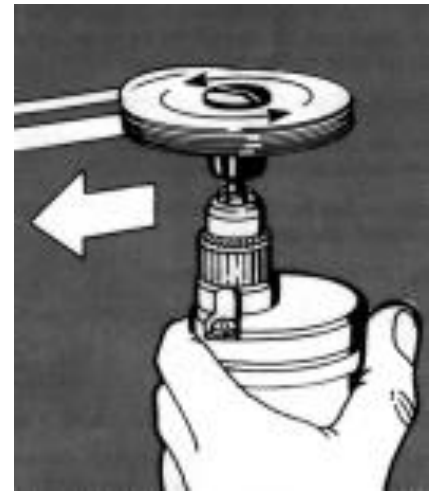
Pin Stripe Eraser Wheel Operation