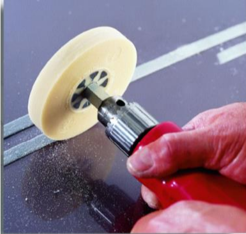
3M™ Stripe-Off Wheel (Part Nos. 07498 or 07499)