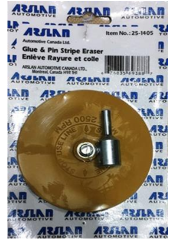
Generic Pin stripe eraser